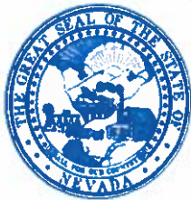
JOE LOMBARDO Governor

400 W. King Street, Suite 106 Carson City, Nevada 89703 (775) 684-7040 • Fax (775) 684-7052 http://minerals.nv.gov/